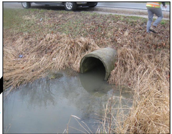
EAST SIDE SR 60 DITCH TO 30" CULVERT UNDER SR 60