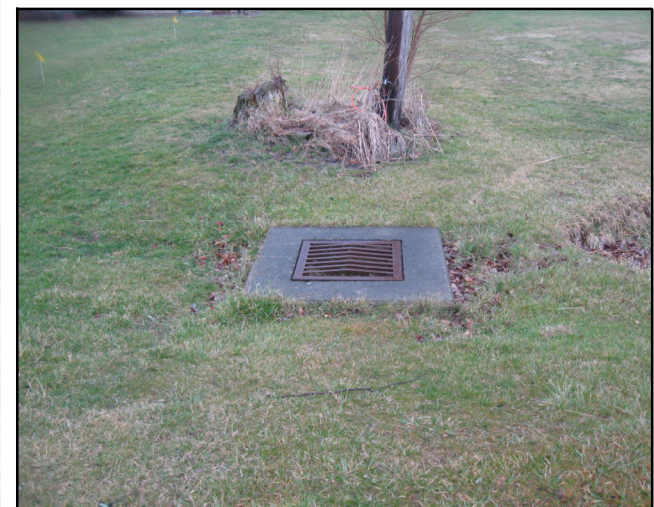
WEST SIDE SR 60 CB TO DITCH ALONG SR 60 NORTH